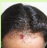
After 4 months