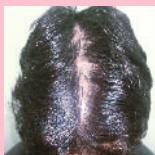
Before 4 months