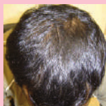
After 4 months