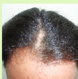
Before 4 months