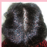
After 4 months