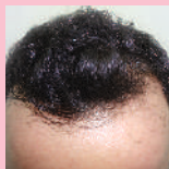
After 6 months